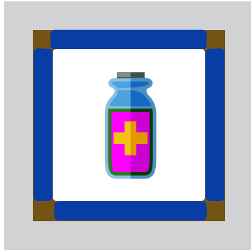
REGIONAL EPS Solutions