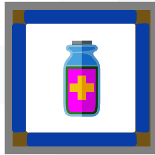
COMPACT VIP Solutions