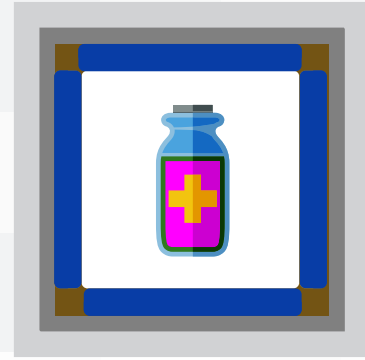
GLOBAL EPS + VIP Solutions